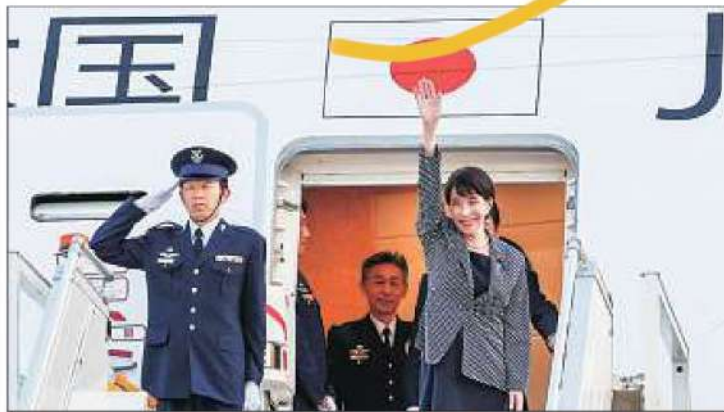
Japanese Prime Minister Sanae Takaichi waves upon her arrival at the airport, in New Delhi.

This is Takaichi's first official visit to India. She is visiting at Modi's invitation from July 1 to 3 for the 16th India-Japan annual summit, the MEA earlier said.