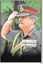
(Contd on page 5)