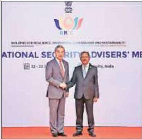
NSA Ajit Doval welcomes Chinese FM Wang Yi at the 16th BRICS National Security Advisers' Meeting, in New Delhi on Tuesday.