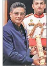
President Droupadi Murmu confers the Padma Bhushan to tennis player Vijay Amritraj, veteran actor Mammooty and singer Alka Yagnik, Padma Shri to former Indian cricket captain Rohit Sharma and actor R Madhavan during the second civil investiture ceremony, at Rashtrapati Bhavan, in New Delhi, on Tuesday.