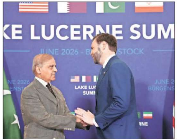
US Vice President J D Vance meets with Pakistan’s PM Shehbaz Sharif in Switzerland on Sunday.

“Iran must immediately stop their highly paid PROXIES in Lebanon from causing trouble. If they don’t, we’ll hit