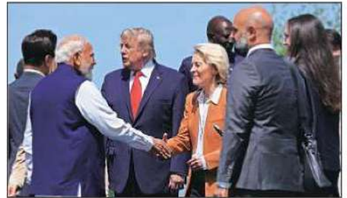
US President Donald Trump, center, India's Prime Minister Narendra Modi, center left, and European Commission President Ursula Von Der Leyen, center right, during a group photo of G7 leaders in G7 summit in Evian, France on Tuesday.