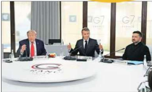
From left, U.S. President Donald Trump, French President Emmanuel Macron and Ukrainian President Volodymyr Zelenskyy during a working session at the G7 summit in Evian-les-Bains, France on Tuesday.

leaders for a morning working session, but talks wrapped quickly, as leaders gathered