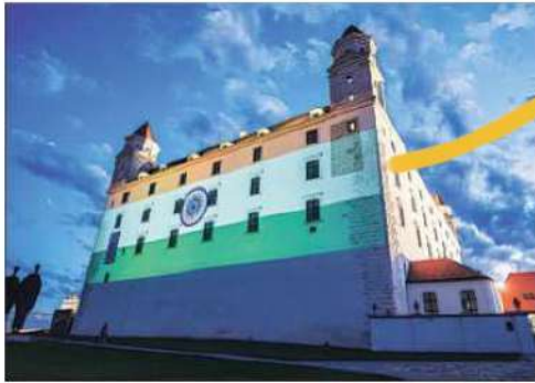
Bratislava Castle is illuminated in the colours of the Indian national flag during Prime Minister Narendra Modi's visit to Slovakia, in Bratislava, Slovakia. The illumination marked the first visit by an Indian Prime Minister to the country and reflected the growing ties between India and Slovakia.

Modi and Fico reaffirmed their commitment to multilateralism