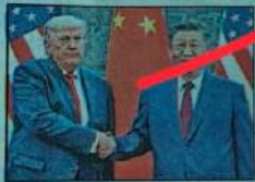
The list comes less than a month after President Trump met China's Xi Jinping on a visit to Beijing

Other firms added include biotech firm WuXi AppTec, AI-driven robotics company RoboSense Technology Co Ltd and