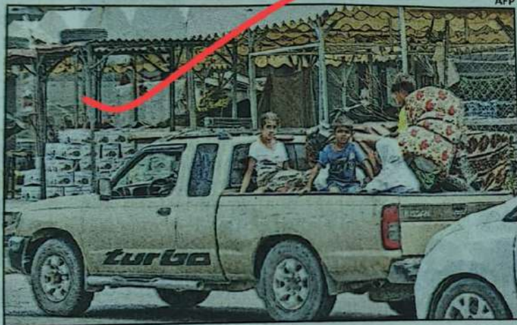
People flee from Tyre in Lebanon after Israel's evacuation warning

In remarks earlier on Tuesday about the downing of the Apache helicopter, Trump had said the two US helicopter