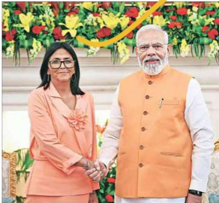
Prime Minister Narendra Modi during a bilateral meeting with Venezuela's Acting President Delcy Rodriguez at the Hyderabad House, in New Delhi.

India's procurement of Venezuelan crude oil has picked up momentum since April and the South American nation has already emerged as the third largest oil supplier to the coun-