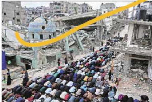
Palestinians offer Eid al-Adha prayers beside the ruins of a mosque destroyed by Israeli bombardment, in Khan Younis, southern Gaza Strip on Wednesday.

"We pledged to eliminate everyone who led the October 7 massacre and this is what we will do: they are all bound to die, everywhere," Katz wrote on X on Wednesday. "We pledged that Hamas will not hold civilian or military rule." Prime Minister Benjamin Netanyahu, who is preparing for elections in the fall, also threatened that Israel will target everyone involved in the