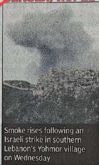
Smoke rises following an Israeli strike in southern Lebanon's Yohmor village on Wednesday