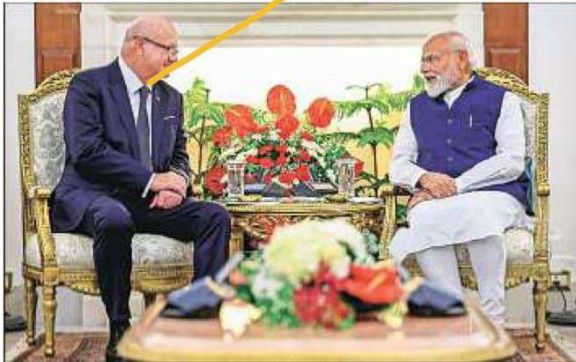
Prime Minister Narendra Modi with Austria's Chancellor Christian Stocker during a meeting, at Hyderabad House, in New Delhi.