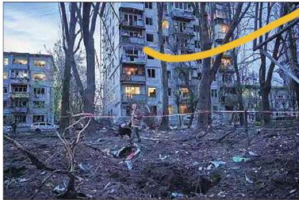
A woman walks among the rubble of a house damaged after a Russian strike on residential area in Kyiv, Ukraine, on Thursday.

Russia launched nearly 700 drones and dozens of ballistic and cruise missiles, primarily targeting civilians, authorities said. Moscow's forces have hit civilian areas almost daily since its all-out invasion of its neighbour more than four years ago, with the regular assaults occasionally punctuated by massive attacks.