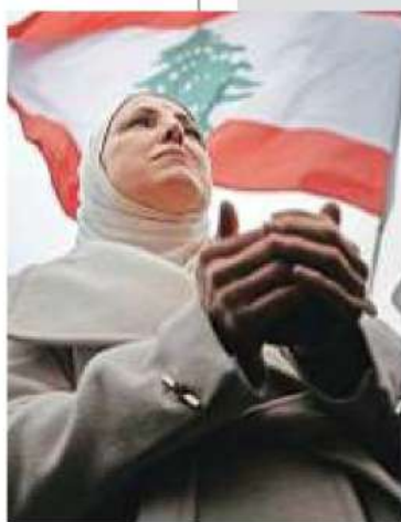
A woman holds a candle during a vigil for people killed in Lebanon during the Iran war, in Dearborn, Mich.

"Our goals and those of the United States (Contd on page 3)