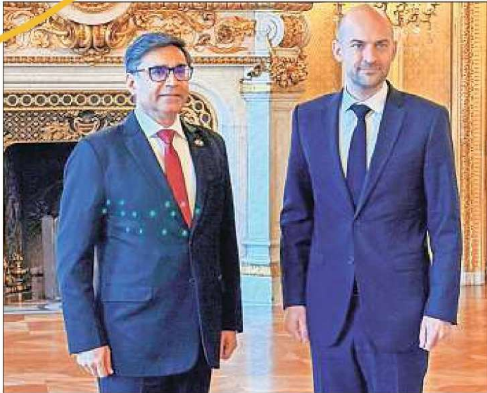
Foreign Secretary Vikram Misri with French Minister for Europe and Foreign Affairs Jean-Noel Barrot during a meeting.

"Discussions covered key areas of bilateral cooperation, ongoing global challenges, including the situation in the Middle East," the Indian Embassy in Paris post-