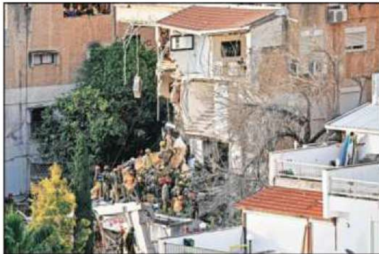
Israeli rescue teams search for missing people amid the rubble of a residential building a day after it was struck by an Iranian missile in Haifa, Israel on Monday.

Guard, Major General Majid Khademi, according to Iranian state media and Israel's Defense