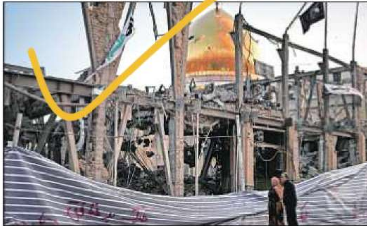
Pedestrians look at a destroyed building within the Grand Hosseiniyeh, with the mosque visible in the background, which was hit by US-Israeli airstrikes in Zanjaan, Iran.

Among those killed was the head of Intelligence for Iran's paramilitary Revolutionary