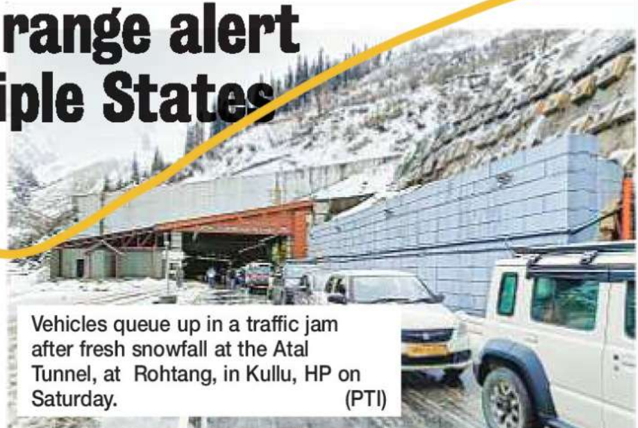
Vehicles queue up in a traffic jam after fresh snowfall at the Atal Tunnel, at Rohtang, in Kullu, HP on Saturday.

The warning covers Punjab, Haryana, Uttarakhand, Himachal Pradesh, Uttar Pradesh, East Rajasthan, Madhya Pradesh, Maharashtra, Marathwada, Vidarbha, East Uttar Pradesh, and Chhattisgarh. According to the IMD, these regions are likely to witness