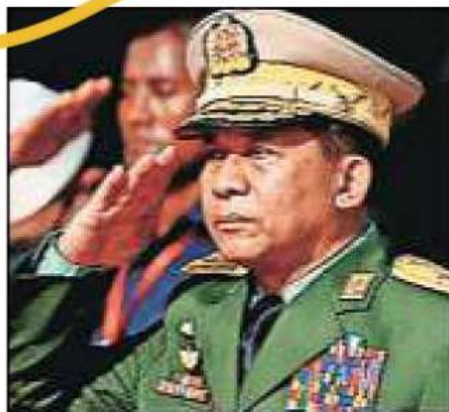
Min Aung Hlaing

The move marks a nominal return to an elected government but is widely considered to be an effort to keep the Army in power after an election organised by the military that