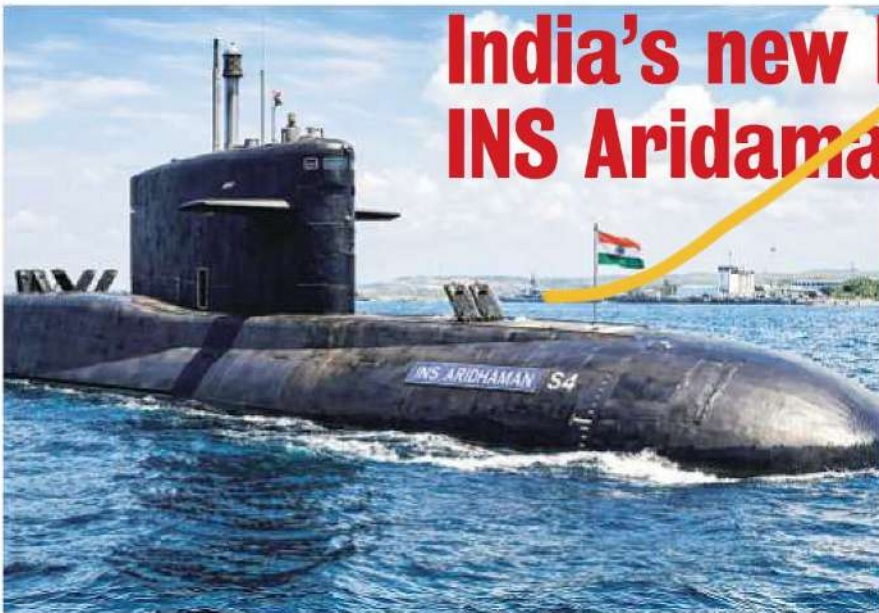
Indian Navy's INS Aridaman, third indigenously built nuclear-powered ballistic missile submarine, ahead of its commissioning ceremony.