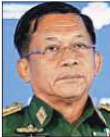
Min Aung Hlaing