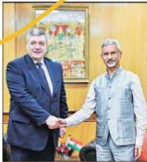
External Affairs Minister S Jaishankar during a meeting with Deputy Minister of Foreign Affairs of Russia Andrey Rudenko, in New Delhi.

"Good to meet Deputy Foreign Minister Andrey Rudenko of Russia. Spoke about further advancement of our wide-ranging cooperation. As well as regional and global develop-