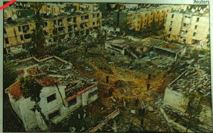
A drone view shows a damage in a residential neighbourhood in Dimona, Israel. Southern Israeli towns woke to widespread damage on Sunday after air defences failed to intercept two Iranian missiles overnight that injured scores of civilians in one of the worst attacks of the war so far on Israel

Israeli PM Benjamin Netanyahu on Sunday said the recent missile attacks on Diego Garcia shows that Iran has the capacity to reach deep into Europe and poses danger to the entire world. Netanyahu was visiting the southern Israeli city of Arad which faced Iranian missile strikes Saturday when he also said his country and the US are fighting together on behalf of everyone.