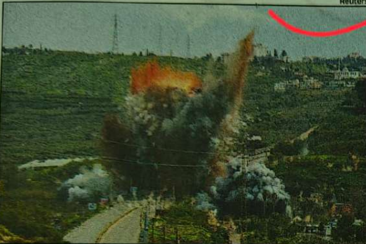
Smoke rises after an Israeli strike on a bridge near Qasmiyeh, Lebanon, on Sunday. Lebanese President Joseph Aoun slammed the strikes on infrastructure, calling such attacks a 'prelude to a ground invasion'

Points To Attacks On Diego Garcia, Israeli Cities, Blocking Of Int'l Maritime Route