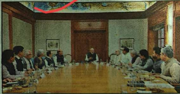
The effect on India was assessed and counter-measures, both immediate and long-term, were discussed, an official statement said

The assessment was that there may not be a significant domestic impact in the immediate term, but there was a need to prepare for the medium and long term. Currently,