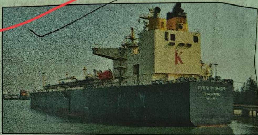
Pyxis Pioneer brought 16,714 metric tonnes of LPG to Mangaluru

According to ship tracker Marine Traffic, the Cameroon-flagged Aqua Titan