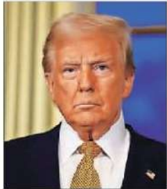
By Amer Madhani and Will Weissert WASHINGTON, Mar 20 (AP)

PRESIDENT Donald Trump and Israeli Prime Minister Benjamin Netanyahu's diverging language on Israel's decision to attack a critical Iranian gas field marks the most notable difference of opinion between the two leaders since the start of the 20-day war against Iran.