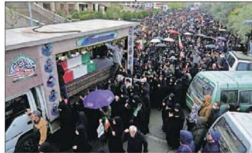
Iranians attend the funeral procession of Iran's Intelligence Minister Esmail Khatib, his wife and daughter, in Tehran, Iran on Friday.