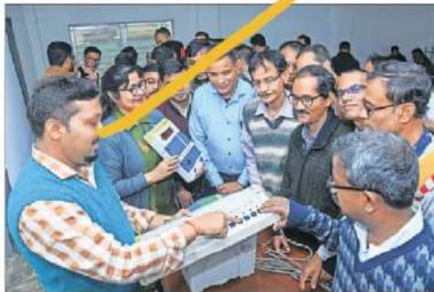
Electoral officers demonstrate functioning of EVM-VVPAT during a special training of polling and presiding officers ahead Assembly election in Tezpur College, Sonitpur, on Friday.

tions, the District Election Officers (DEOs) in all poll-bound States/UTs must complete the first randomisation of EVM-VVPATs that have passed the First Level Checking (FLC).