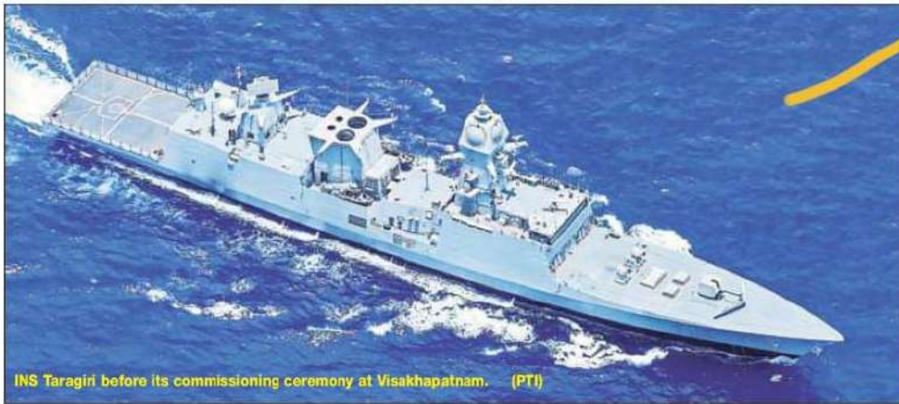
INS Taragiri before its commissioning ceremony at Visakhapatnam.