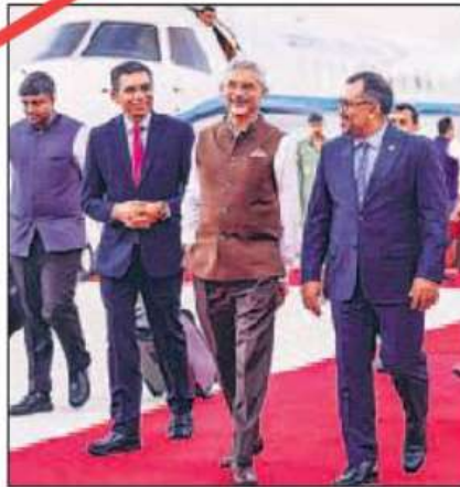
External Affairs Minister S Jaishankar with Maldives Foreign Affairs Minister Moosa Zameer upon his arrival at the airport in Maldives.

Jaishankar arrived here on Friday evening for a three-day official visit to reset the bilateral relationship with the Maldives, the first high-level trip from India after the archipelago nation's pro-China