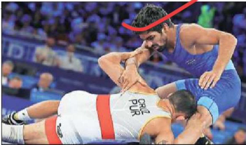
Aman Sehrawat of India and Darian Toi Cruz (red) of Puerto Rico in action during their match.

WRESTLER Aman Sehrawat won the bronze medal, defeating Puerto Rico's Darian Cruz in the men's 57kg free-style category at the Paris Games here on Friday.