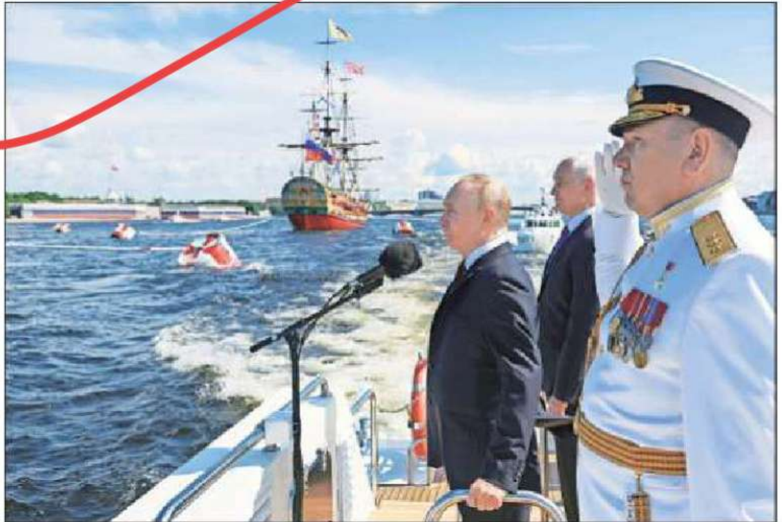
Russian President Vladimir Putin, centre, Russian Defense Minister Andrei Belousov, second right, and Russian Navy Commander-in-Chief Admiral Alexander Moiseyev, right, greet sailors prior to the main naval parade marking Russian Navy Day in St Petersburg, Russia on Sunday.

Over 15,000 service members and vessels of various classes drawn from Russia's Northern, Pacific, and Baltic fleets, the Caspian flotilla, as well as members of the naval force expedition in Syria, participated in the event. However, ships from the Black Sea Fleet