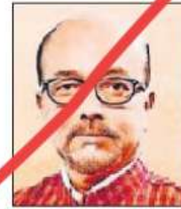
Ramen Deka (Chhattisgarh)