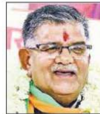
Gulab Chand Kataria (Punjab)