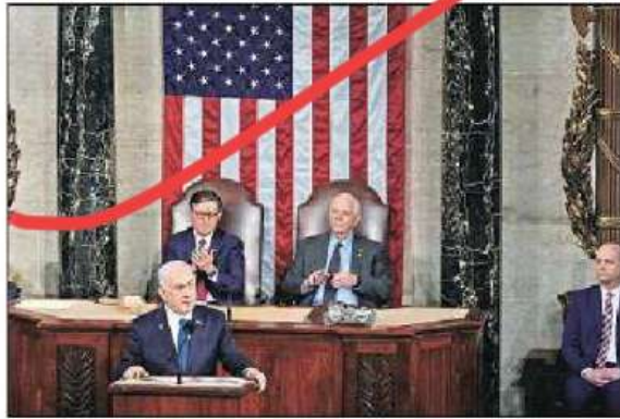
Israeli Prime Minister Benjamin Netanyahu speaks to a joint meeting of Congress at the Capitol in Washington, on Wednesday as House Speaker Mike Johnson of La., and Senate Foreign Relations Chair Ben Cardin, D-Md, listen.

Nine months into the war in Gaza, Netanyahu vowed to press on with the war until "total victory." He also sought bolster US support for his country's fight against Hamas and other Iran-backed armed groups, and bitterly con-