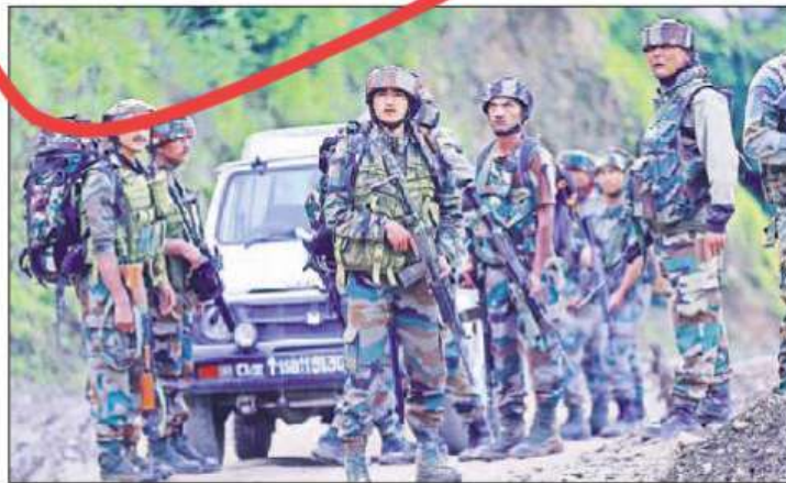
Army personnel during a counter-terror operation following terror attack on an Army convoy in Kathua district on Tuesday.

Five Army personnel were killed and as many injured on Monday when a group of heavily-armed terrorists ambushed (Contd on page 5)