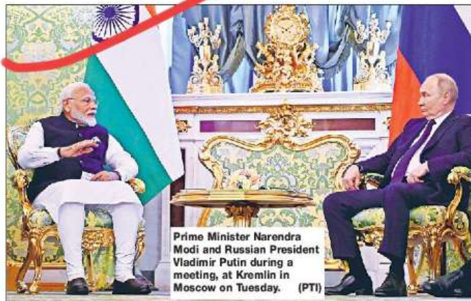
Prime Minister Narendra Modi and Russian President Vladimir Putin during a meeting, at Kremlin in Moscow on Tuesday.

The Indian Prime Minister assured the world community that India is on the side of peace and the conflict must