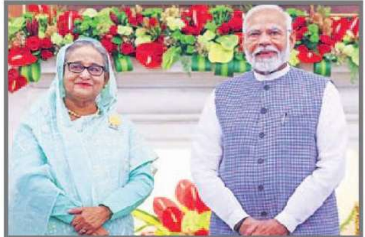
Prime Minister Narendra Modi with his Bangladeshi counterpart Sheikh Hasina during a meeting, at the Hyderabad House in New Delhi on Saturday.

Hasina is expected to travel to China next month. In reflection of growing intensity in their ties, India and Bangladesh also firmed up a "futuristic vision" to further