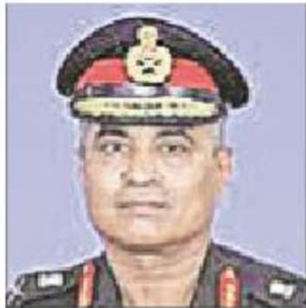
General Manoj Pande

General Pande is visiting Uzbekistan from April 15-18 to explore new avenues of bilateral military collaboration. Exercise 'DUSTLIK' aims to foster military cooperation and enhance combined capabilities to execute joint operations in mountainous as well as semi-urban terrain. It would focus on high degree of physical fitness, joint planning, joint tactical drills and basics of special arms skills, the sources said.