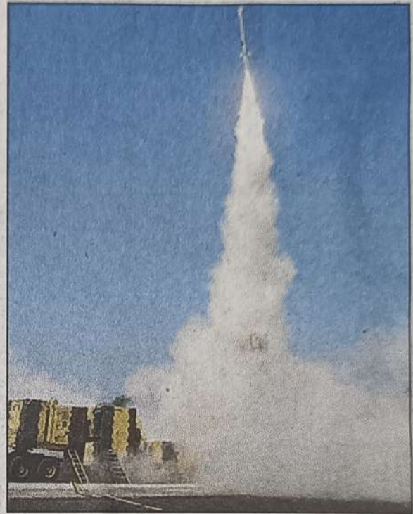
STRIKE RANGE OF 1,000 KM

"This successful flight-test also established the reliable performance of the indigenous propulsion system developed by the Gas Turbine Research Establish-