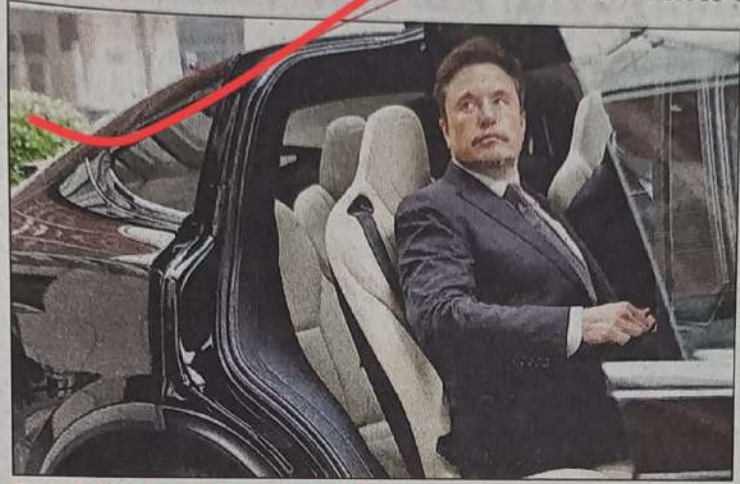
FOR A SEAT AT THE HIGH TABLE: Elon Musk

New Delhi: The US supports much-needed reform of the United Nations, including the security council, to make it reflective of the 21st-century world, a senior Biden administration official has said, amidst growing calls for inclusion of India as the permanent member of the powerful organ of the world body.