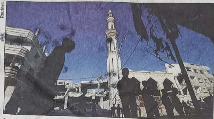
Senior US and Israeli officials held a virtual meeting on Thursday expected to include a discussion of Israel's plans for Rafah. Prez Biden has urged Israel not to conduct its planned large-scale offensive in the Gaza city

Israel welcomed the new sanctions, with foreign minister Israel Katz saying: "This is our opportunity to form a global front and a regional coalition against Iran."