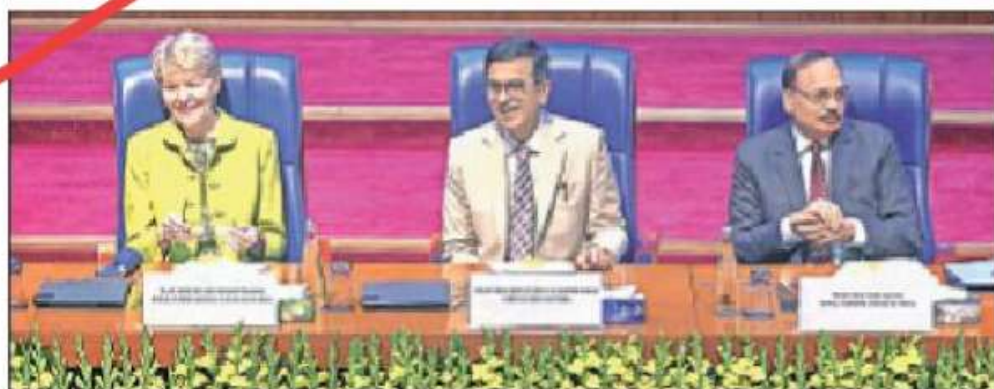
Chief Justice of India (CJI) Justice D Y Chandrachud with International Court of Justice judge Hilary Charlesworth and Supreme Court Judge Justice Surya Kant during the Foundation Day lecture, in New Delhi on Saturday.

“It is important to emphasise that diversity and representation is crucial not only for rectifying historical injustices but also for enriching the decision-making capacity of courts. The evolving representation of nation-states before the International Court of Justice (ICJ) has notably challenged its historically monocultural and Eurocentric outlook,” he said. “Likewise, integrating gender diversity within the courts