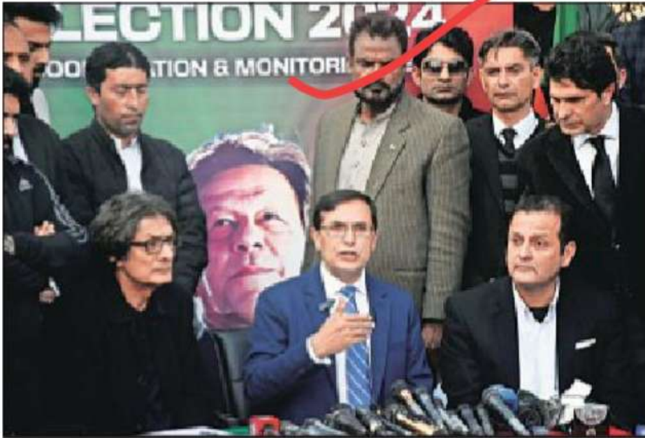
Gohar Khan (C) chairman of Pakistan Tehreek-e-Insaf (PTI) speaks during a press meet in Islamabad, Pakistan, Saturday.