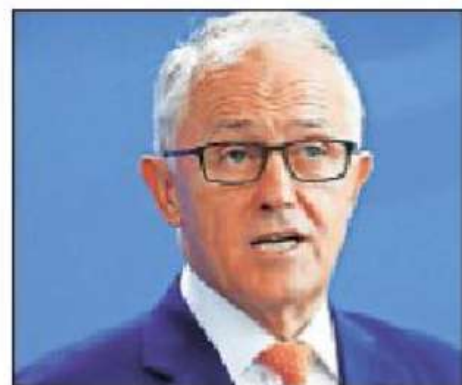
Ex-Australia PM Malcolm Turnbull

The 29th Australian Prime Minister said the two countries have got many things in common -- the love for cricket, rule of law and democracy -- and