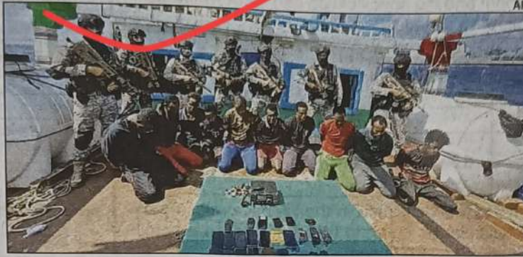
INS Sumitra rescued hijacked Iranian-flagged fishing vessel Al Naeemi with Pakistani crew members off east coast of Somalia on Monday

"We will not be considered a responsible country if bad things happen around our neighbourhood and we say I