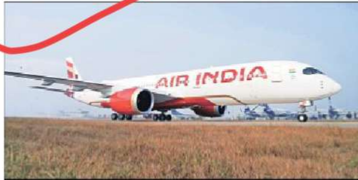
Air India's first Airbus A350-900 (VT-JRA) touches down at Delhi Airport in New Delhi on Saturday. (ANI)

"Air India, India's leading global airline, today welcomed the first of 20 Airbus A350-900 aircraft, registered VT-JRA, in the airline's bold new livery, marking a turning point in its ongoing transformation story," an official statement issued