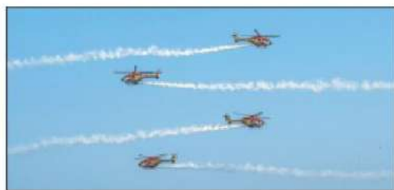
(Clockwise) Defence Minister Rajnath Singh reviews the Combined Graduation Parade on Sunday. Cadets celebrate after the Combined Graduation Parade. Indian Air Force's 'Sarang' aerobatic team performs during the parade. IAF's 'Surya Kiran' aerobatic team performs. Flight Cadets being awarded their 'Stripes' by Union Minister during Graduation Parade at the Air Force Academy in Dundigal.