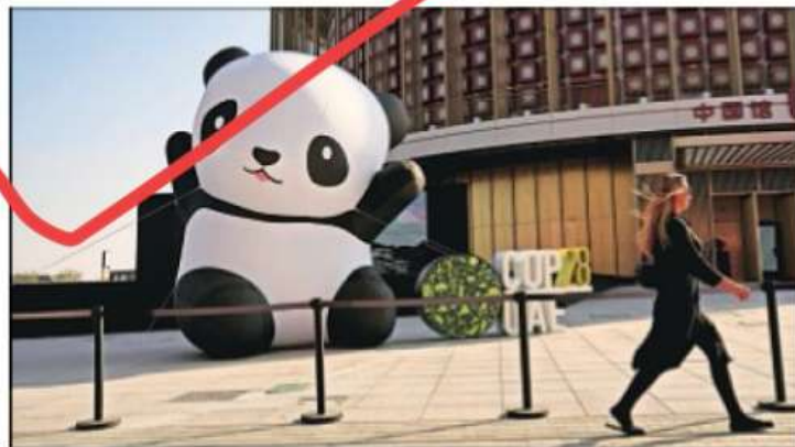
A woman walks outside of the China Pavilion near an inflatable panda at the COP28 UN Climate Summit, on Friday, in Dubai, United Arab Emirates.

The Green Rising Global Initiative will create pathways for at least 10 million children to contribute to countries’ ambitious National Action Plans on Climate