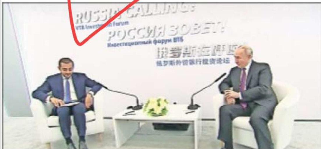
Russian President Putin at the 14th VTB Investment Forum 'Russia Calling', on Thursday.