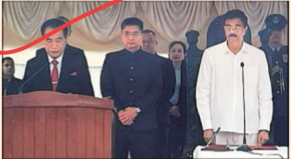
ZPM leader Lalduhoma takes oath as the Chief Minister of Mizoram during swearing-in ceremony in Aizawl on Friday. Governor Hari Babu Kambhampati is also seen.

The swearing-in ceremony was held at the Raj Bhawan where Mizo National Front leader and outgoing Chief Minister Zoramthanga was present. All MNF MLAs, including its legislature party leader Lalchhandama Ralte, attended the event. Former Chief Minister Lal Thanhawla was also present there. On Tuesday, the ZPM Legislature Party elected Lalduhoma as its leader and K Sapdanga as the deputy leader.