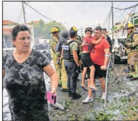
Israelis evacuate a site struck by a rocket fired from the Gaza Strip, in Ashkelon, southern Israel on Monday. Israel witnessed a unprecedented attack by Hamas on Saturday.

ly for its basic supplies and such a decision will have far-reaching consequences for 2.3 million people living in the densely populated area.