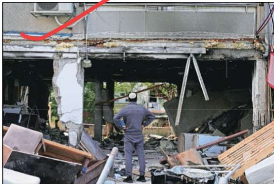
A man looks at destruction made by a rocket fired from the Gaza Strip in Ashkelon on Monday. Israel's military battled to drive Hamas fighters out of southern towns and seal its borders on Monday as it pounded the Gaza Strip from the air.

As airstrikes continued on the Gaza Strip on Monday, the Israeli Air Force (IAF) claimed that more than 500 Hamas and Islamic Jihad targets in the coastal enclave were hit overnight, the BBC reported.