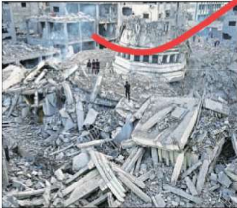
Palestinians inspect the rubble of the Yassin Mosque destroyed after it was hit by an Israeli airstrike at Shati refugee camp in Gaza City, early on Monday.

Prime Minister Netanyahu also told local politicians from southern Israel that Israel will transform the region as it retaliates for a devastating