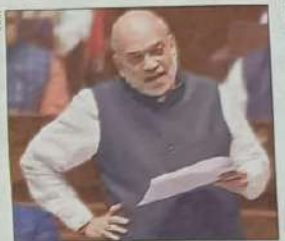
Amit Shah in Rajya Sabha

Shah was replying to the two-day debate in Rajya Sabha to mark 75 years of the Constitution. He also asserted that BJP would bring Uniform Civil Code in every state through democratic processes. P 15