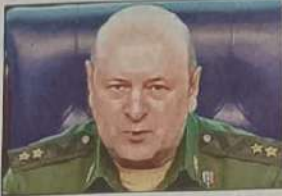
Lt Gen Igor Kirillov was charged in absentia by the SBU for 'ordering the use of banned chemical weapons against Ukraine's forces'

The bomb used in Tuesday's attack was triggered remotely, according to Russian news reports. Images from the scene showed shattered windows and scorched brickwork. The killing was the highest-profile apparent assassination of a Russian military official far from the battlefield since the start of the 2022 invasion. While other Russian generals have