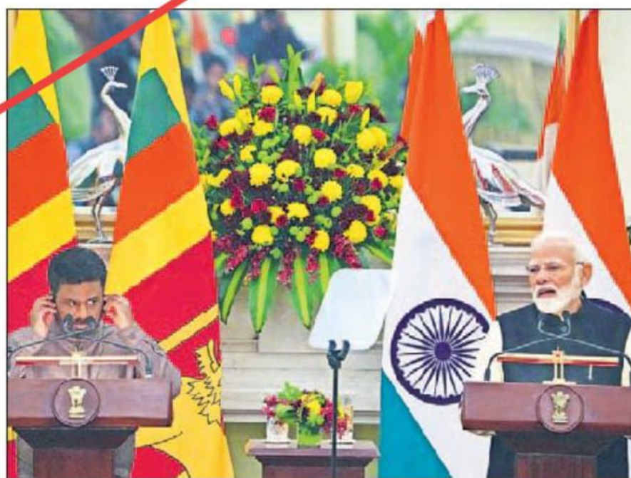
Prime Minister Narendra Modi with Sri Lankan President Anura Kumara Disanayake during a joint press meet at the Hyderabad House, in New Delhi on Monday.

The Prime Minister also announced that a ferry service will be started between