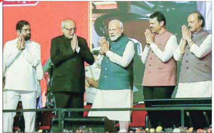
Prime Minister Narendra Modi and Maharashtra Governor CP Radhakrishnan with the newly-sworn Maharashtra Chief Minister Devendra Fadnavis and Deputy Chief Ministers Eknath Shinde and Ajit Pawar during the swearing-in ceremony, in Mumbai on Thursday.

led the party to victory in 132 seats in the 288-member House. The BJP-Shiv Sena-NCP 'Mahayuti' coalition has a commanding majority of 230 seats. A delegation of the ruling MahaYuti alliance met the Governor at Raj Bhawan on Wednesday, soon after Fadnavis was unanimously elected State BJP legislature party leader. At a press conference at Raj Bhawan immediately after the meeting, Shinde said, "I am happy that at this place around two and a half years ago, Fadnavis had recommended that I should become the CM. Now, we have given a letter of recommendation from Shiv Sena for Fadnavis to become CM. This Government is being formed in a healthy atmosphere." Fadnavis, who has served as Chief Minister twice, led the BJP-Shiv Sena Government from 2014 to 2019. After the 2019 elections, when the then Uddhav Thackeray-led Shiv Sena broke ties with the BJP over the CM post, Fadnavis was sworn in again with Ajit Pawar as his deputy. However, that Government lasted only 72 hours due to Pawar's failure to secure sufficient support from NCP MLAs. Following a