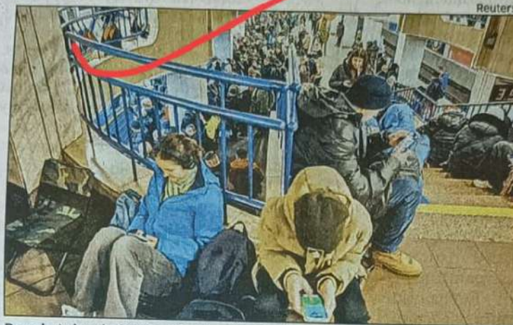
People take shelter inside a metro station in Kyiv on Thursday

Putin also said that Russia may use its new Oreshnik hypersonic missile to attack "decision-making centres" in Kyiv in response to Ukraine's firing of Western missiles at Russian territory. Russia has not so far struck Ukrainian mini-