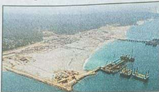
Now handling 4.5 million containers, Vizhinjam port will be southern India's largest freight terminal

Kerala signed Thursday a supplementary concession agreement with Adani Vizhinjam Port Pvt Ltd, paving the way for earlier-than-expected revenue gains from Vizhinjam deep-water international