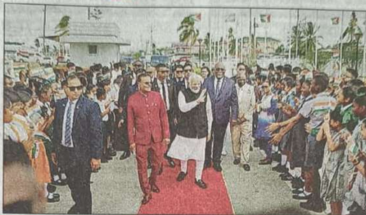
PM Narendra Modi on Thursday became the first Indian prime minister to address the Guyana Parliament

Modi said this is not the time for conflict for the world, but the time to identify the conditions causing conflict and removing them. "Today, there are many such challenges like terrorism, drugs, cyber crime, and only by facing them we will be able to improve the future of our future