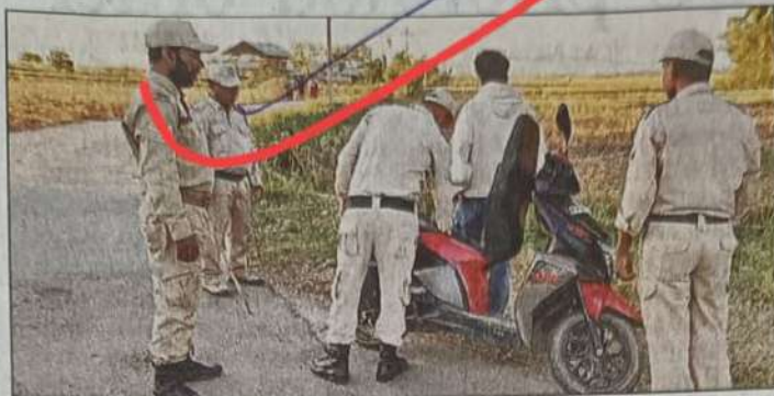
Security personnel step up vigil as violence spiralled in Manipur. The Kuki MLAs accused the govt of escalating tensions for political motives

The Kuki MLAs advocated for extending Afspa to the re-