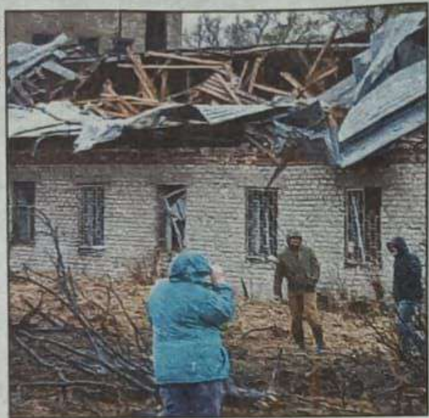
Residents at the site of the Russian missile strike in Dnipro