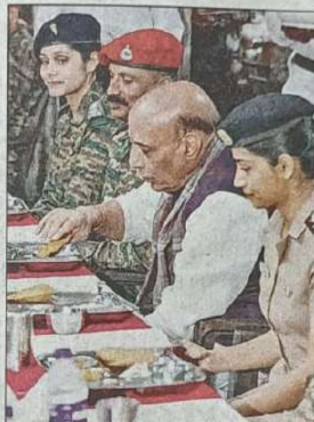
Rajnath has dinner with Army personnel at Sonitpur, Assam

India will continue the process to restore peace along LAC on the basis of consensus achieved with China, defence minister Rajnath Singh said Wednesday during his trip to Tezpur in Assam. He will visit Tawang in Arunachal on Thursday. Tawang is one of the major flashpoints between India and China, with the latter claiming it as part of 'South Tibet'. On Dec 9, 2022, Chinese troops had tried to transgress across LAC at Yangtse in the Tawang sector, which had led to a major physical clash. P 16