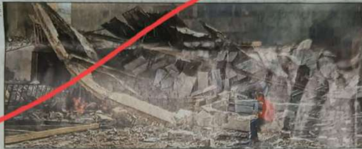
An Israeli strike on a school where displaced people were sheltering in central Gaza Strip killed 17 people on Thursday, Palestinian officials said

David Barnea, the head of its Mossad intelligence agency, would travel to Doha on Sunday, said PM Benjamin Netanyahu's office, adding that CIA director William Burns would be present for the talks. Separately, an Egyptian security delegation met with a Hamas delegation in Cairo as part of efforts to re-