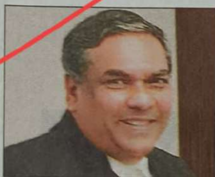
Justice Khanna was elevated as an SC judge on Jan 18, 2019

Justice Khanna's judicial career began with his appointment as an additional judge of Delhi HC in 2005, where he was later made a permanent judge. As HC