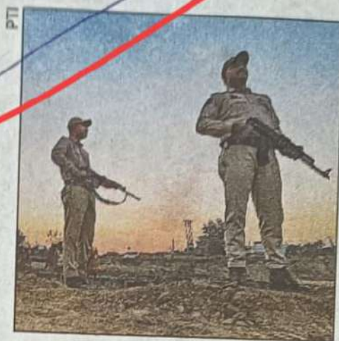
Security personnel stand guard along the Samba highway project following the recent attack on project workers at Ganderbal

Three more RR men and two porters were wounded in the fourth terrorist attack since the new coalition govt led by CM Omar Abdullah assumed office in J&K on Oct 16, though the three-phase assembly elections held from Sept 18 to Oct 1