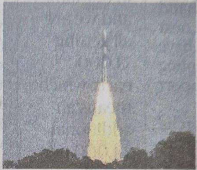
ISRO rocket carrying EOS-06 satellite in 2022.

"Cyclonic storm Dana is fast approaching the coastal districts of Odisha and West Bengal. ISRO polar orbiting satellite EOS-06 and geostationary satellite INSAT-3DR are regularly providing valuable information on the cyclone status. ISRO polar orbiting satellite EOS-06