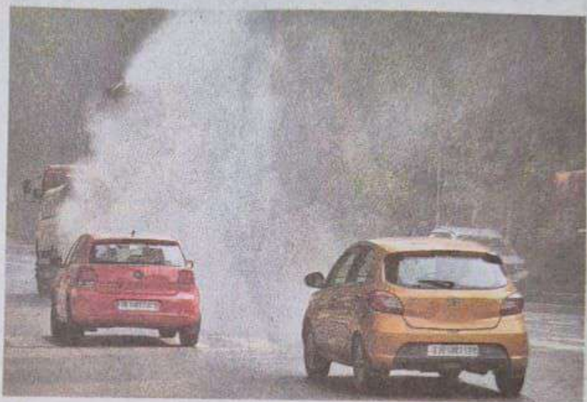
An anti-smog gun being used to sprinkle water to curb pollution in New Delhi on Tuesday.