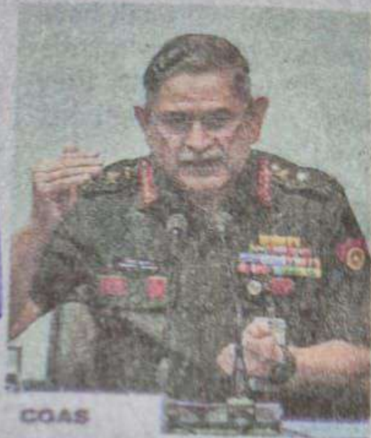
COAS Upendra Dwivedi

"Trust will get restored if we are able to see each other. And we are able to convince each other... that buffer zones which are there, which have been created, we are not creeping. Both have to reassure each other. Patrolling gives you that kind of advantage. And as we restore the trust, the other stages will also follow through soon," General Dwivedi said.