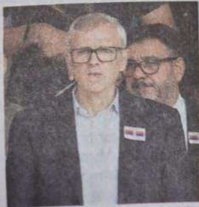
CM Omar Abdullah was the first to take the oath in Kashmiri.

"Today 29 MLAs of the BJP took their oaths to fulfil the vision of Prime Minister Narendra Modi regarding development and peace in J&K. Our party strongly condemns the unfortunate terrorist attack in Ganderbal on innocent