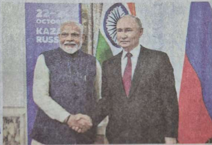
Continued engagement: Prime Minister Narendra Modi meets Russian President Vladimir Putin in Kazan, Russia on Tuesday.

tinuous contact over the conflict between Russia and Ukraine. As I have said before, we continue to believe that these disputes should be resolved through peaceful means. We support restoration of peace and stability as soon as possible. Our efforts