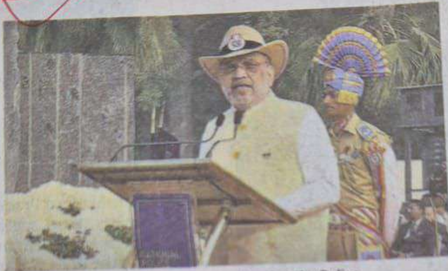
Union Home Minister Amit Shah addressing the Police Commemoration Day function in New Delhi on Monday.