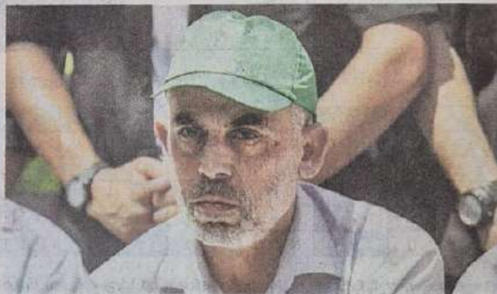
Major stake: Yahya Sinwar had been Hamas's top leader inside the Gaza Strip for years, closely connected to its military wing.

Defence Minister Yoav Gallant addressed Hamas fighters, saying it "is time to go out, release the hostages, raise your hands,