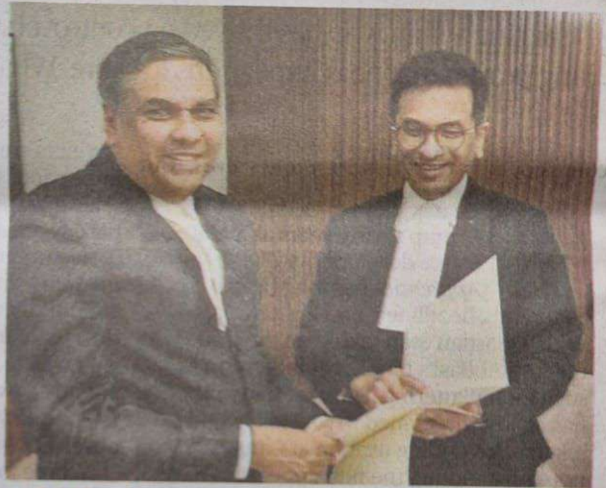
Judicial handover: Chief Justice of India D.Y. Chandrachud with Justice Sanjiv Khanna.

nior standing counsel for the Income Tax Department. He had functioned as a standing counsel for the National Capital Territory of Delhi and appeared as an Additional Public Prosecutor and amicus curiae in the High Court.