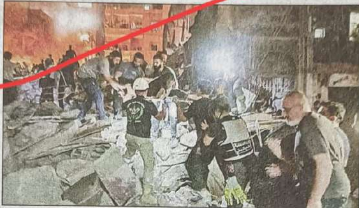
22 DEAD IN BEIRUT: Rescue workers scoured the wreckage of a Beirut neighborhood on Friday after Lebanese officials said that Israeli air strikes had killed at least 22 people. One of the strikes hit the central Basta area, which is close to several Western embassies and the Lebanese parliament

In a video released on Friday, the Israeli military's chief of staff, Lt Gen Herzl Halevi, said it would not stop its campaign "until we ensure that we can safely return the residents not just now, but with a future outlook". The watchtower that came under Israeli fire on Friday is located at UNIFIL's main base in Naqoura. UNIFIL said