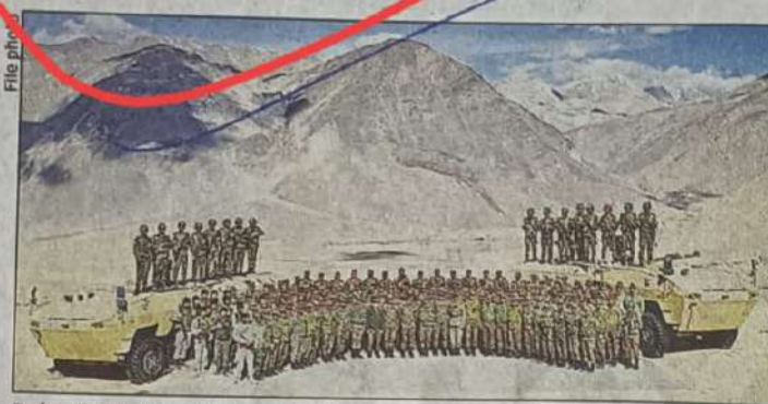
Rajnath Singh said the armed forces must be prepared for 'asymmetric warfare', which has been brought home by ongoing conflicts in the present 'complex and ambiguous world situation'

Singh's statement came against the backdrop of China's propensity for double-speak, with there often being a