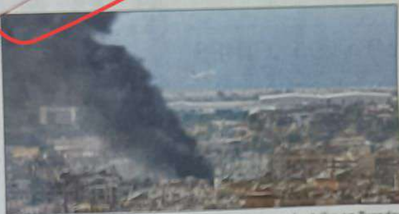
Smoke rises in Beirut's southern suburbs after an air strike on Tuesday

Israel's military said Tuesday it had deployed a fourth army division into southwest Lebanon, signalling an expanding ground offensive against Hezbollah. The military said it had sent the 140th Division into Lebanon, the first reserve division to have been deployed over the border. The statement didn't specify how many soldiers were now inside Lebanon, but