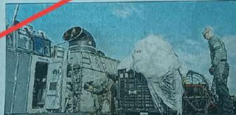
SPIES IN THE SKIES: US Navy sailors with the remains of a Chinese spy balloon after it was shot down in Feb 2023

was at an altitude of over 55,000 feet, way over what had been practised earlier. The target balloon, with a payload, was relatively smaller than the Chinese one that violated US airspace," he added.