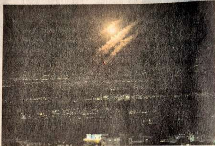
Under fire: A picture taken from the West Bank's Hebron shows projectiles above the Israeli city of Ashdod on Tuesday night.

Reuters journalists saw missiles intercepted in the airspace of neighbouring Jordan. Israeli military said Iran fired around 180 missiles. "IDF (Israeli Army) systems have identified approximately 180 missiles fired towards Israeli territory from Iran," it said.