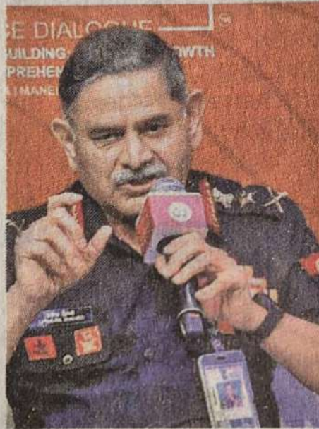
General Upendra Dwivedi

“The situation on the ground today is stable but it is not normal and it is sensitive. We want the situation that existed pre-April 2020 to be restored, whether it be the ground occupation or situation, the buffer zones that have been created or the patrolling that has