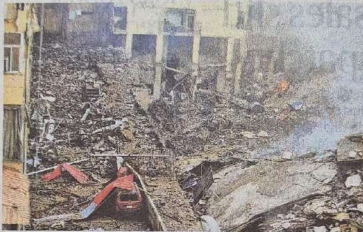
Smoke rises: Destruction at the site of an overnight Israeli airstrike on the Laylaki neighbourhood in southern Beirut on Tuesday.

The Israeli Defence Forces (IDF) said the operations in Lebanon began on Monday night and involved paratroops and commandos from the elite 98th division, which was deployed to the northern front two weeks ago from Gaza where they had been fighting for months.