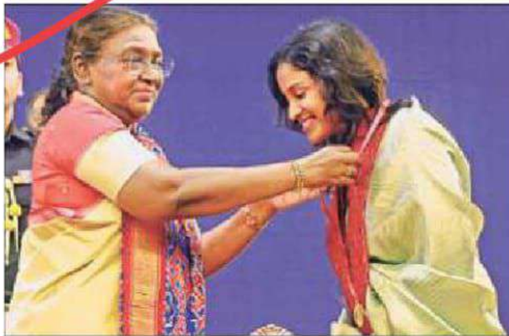
President Droupadi Murmu during the 21st convocation of NALSAR University of Law, in Hyderabad on Saturday.

She expressed confidence that the graduating students would utilise their education in NALSAR as an effective instrument of social justice and