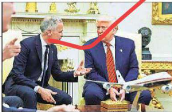
US President Donald Trump and Canadian Prime Minister Mark Carney meet in White House, Washington on Tuesday.

Asked by a reporter if there was anything Carney could tell