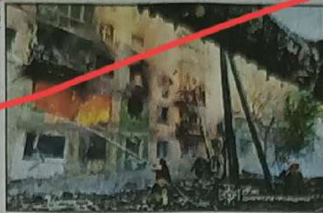
Ukrainian rescuers evacuate people from a building on fire following a drone attack in Pavlograd on Friday

Crimea is a strategic peninsula along the Black Sea in southern Ukraine. It was seized by Russia in 2014, while President Barack Obama was in office. "They've had their submarines there for long before any period that we're talking about, for many years.