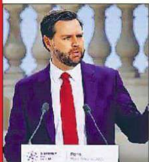
NEW DELHI, Apr 17 (PTI)

INDIA on Thursday said it is "very positive" that the upcoming visit of US Vice President J D Vance will give "further boost" to the India-US bilateral ties and "all relevant issues" will be on the table.