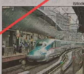
The E5 (in pic) and E3 sets are expected to arrive by early 2026

According to a report by Japan Times, both countries