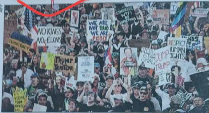
'Hands off' protests against Trump across US cities | INSIDE JACKET

Private sector has been pushing Modi govt to review its investment regime, tightened after Covid in 2020, while