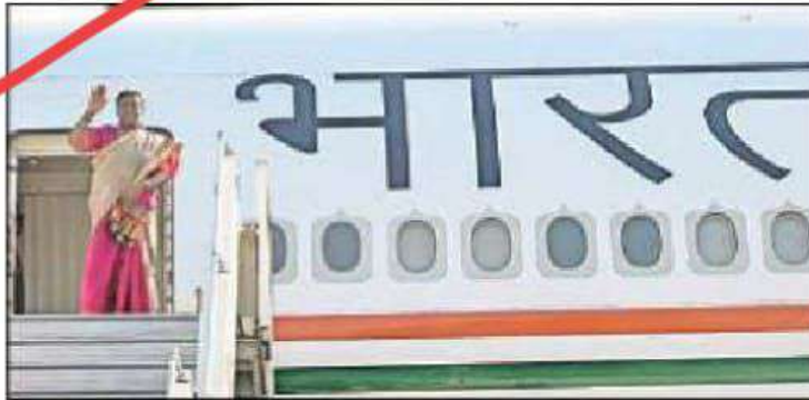
President Droupadi Murmu waves as she emplanes for a state visit to Portugal and the Slovak Republic, in New Delhi.

of External Affairs spokesperson wrote, "President Droupadi Murmu @rashtrapatibhvn emplanes on State visits to Portugal and the Slovak Republic.