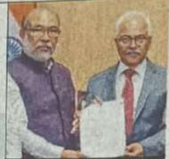
Biren handing his resignation to gov A K Bhalla