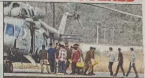
Security personnel take bodies of Naxals to district HQ in Bijapur

➤ Toll expected to rise as encounter still on